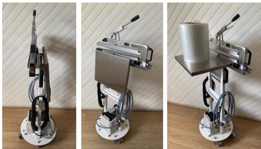
With PAL sealing tong