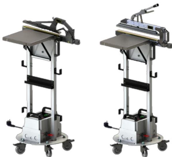
With 1S sealing tong